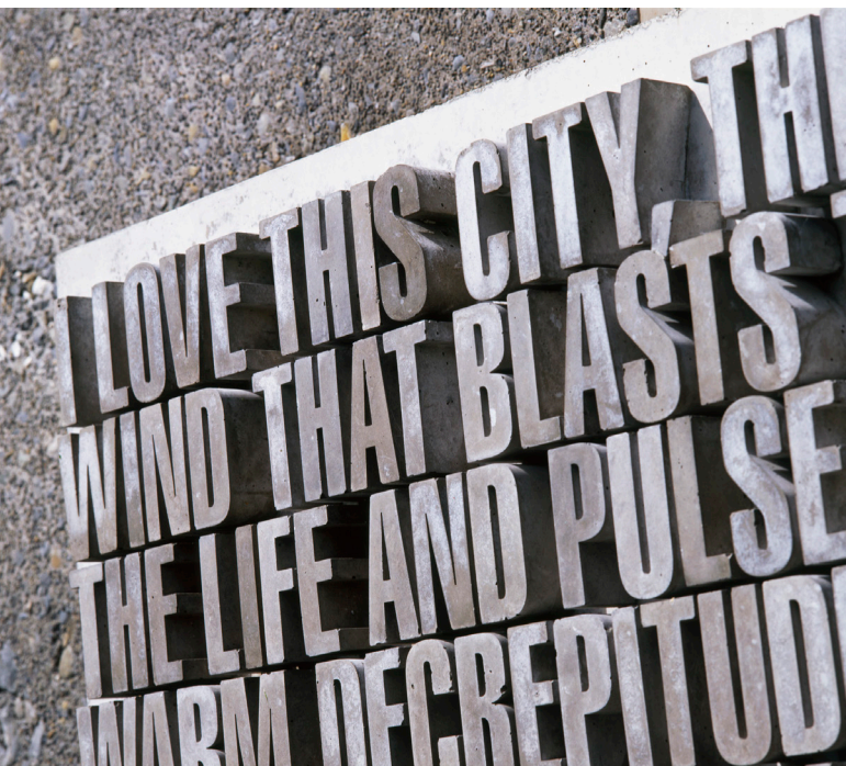
Wellington writers walk