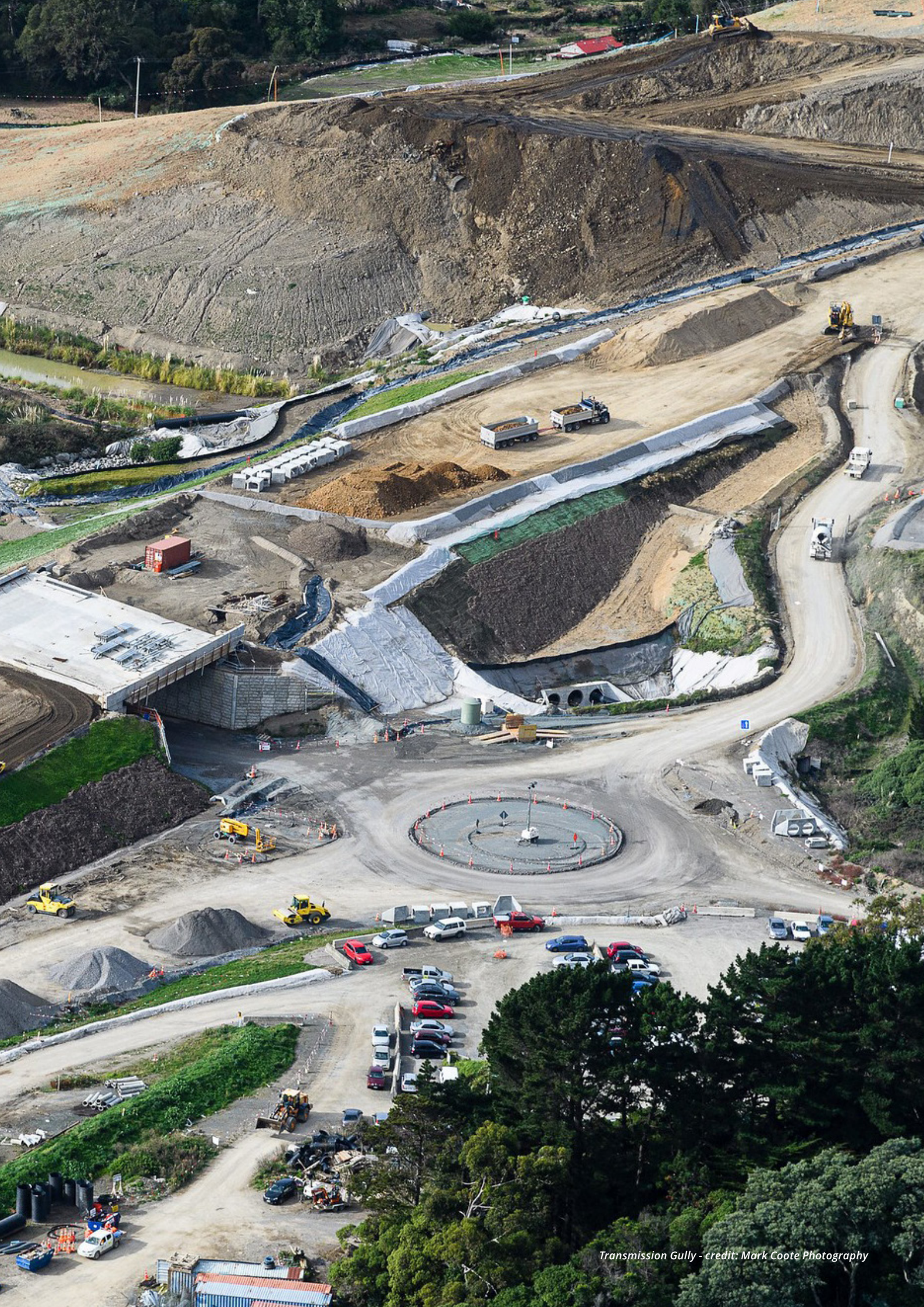
Transmission Gully